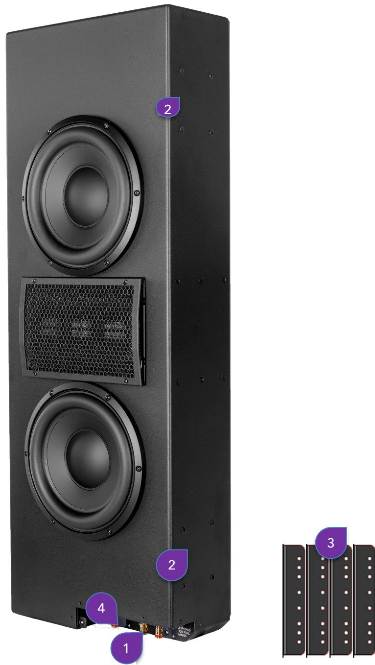
Point 3 GT Side View (Terminal Cover Removed)

NOTE: Binding posts terminal covers removed for clarity