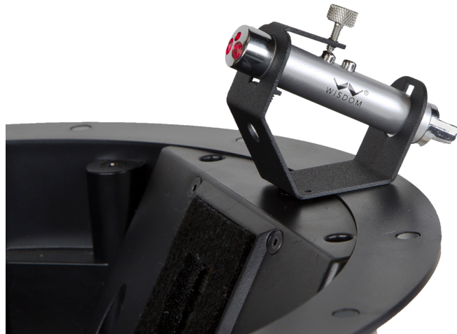
Fig. 1 IC-LAT attached to the ICS7a Planar Magnetic Hybrid Loudspeaker