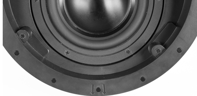
Fig. 2 Directivity indicators