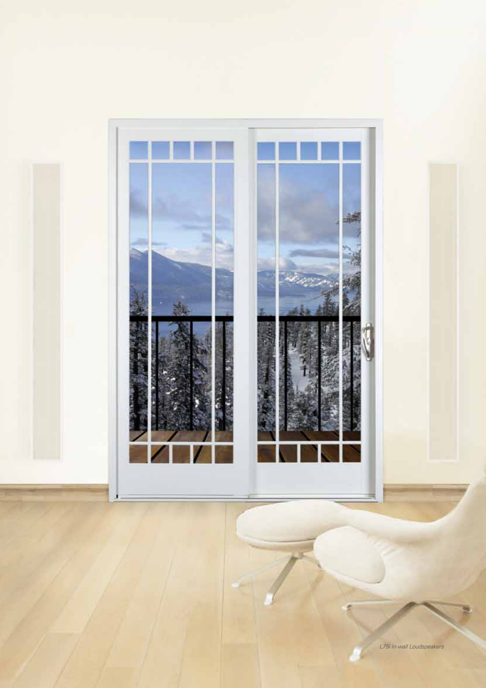
L75i In-wall Loudspeakers